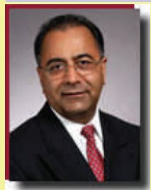
Ontario Minister of Transportation, Harinder Takhar

On February 24, 2006, Ontario Minister of Transportation, Harinder Takhar issued a news release stating that the Ontario Court of Appeal denied the province's leave to appeal the divisional court ruling regarding plate denial for outstanding 407 ETR debts.