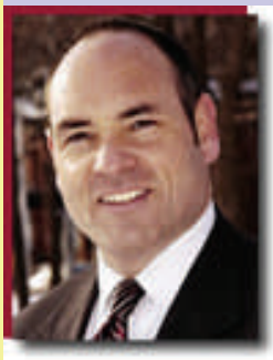
Ontario Minister of Health and Long-Term Care, George Smitherman

On March 1, 2006, Ontario Minister of Health and Long-Term Care, George Smitherman announced the Ontario government is providing Local Health Integration Networks (LHINs) with new powers through legislation, which has now received third and final reading.