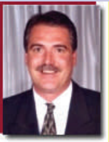
Ontario Labour Minister, Steve Peters

On February 27, 2006, Ontario Labour Minister, Steve Peters introduced legislation that, if passed, would improve the way provincial ministries, agencies and inspectors work together to keep the public, workers, natural resources, and fish and wildlife safe.